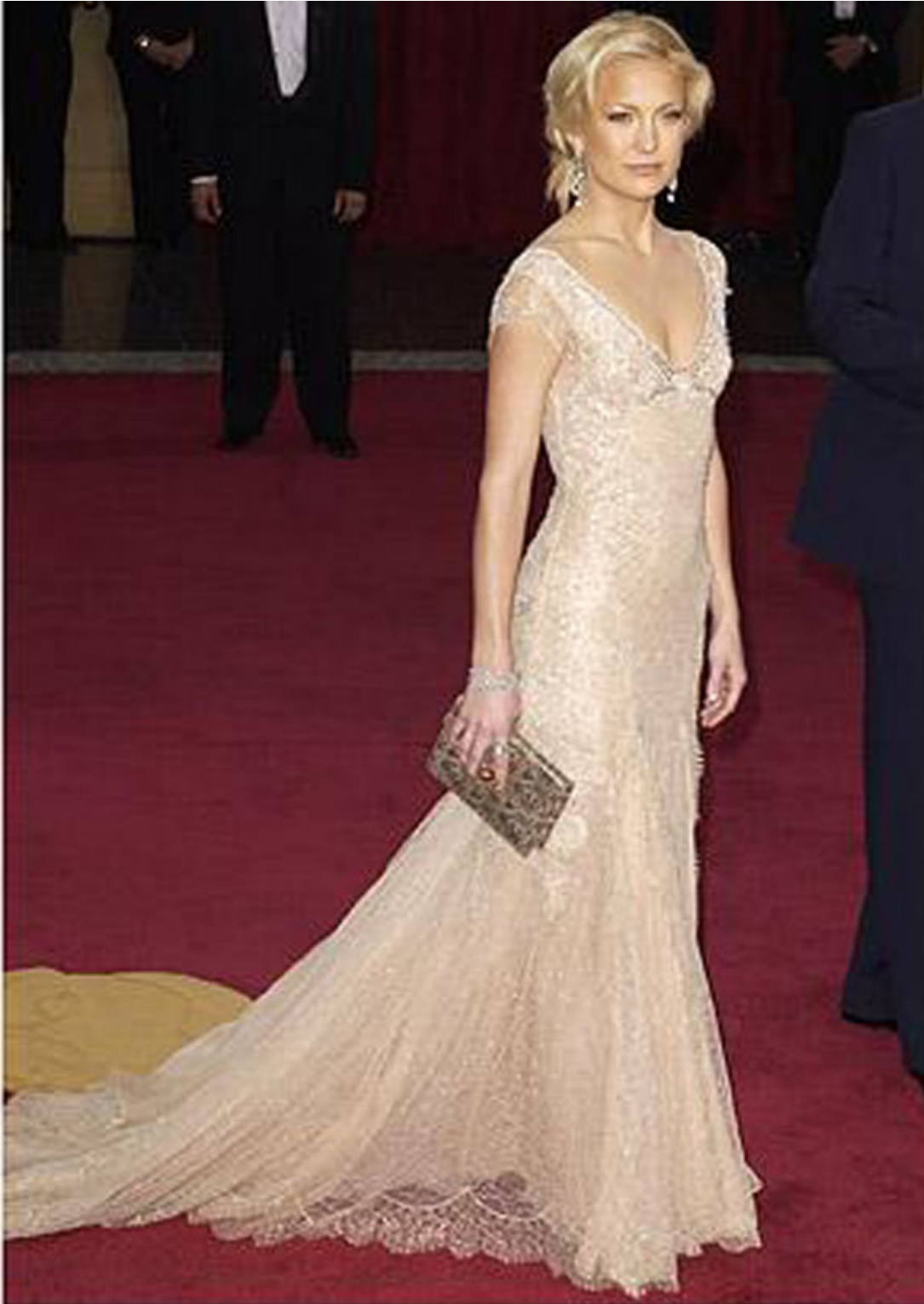
Kate Hudson, 2003

With time, the fashion industry has become more and more focused on the appearance of the models, rather than on their talent. This has led to a rise in the number of models who are overweight and who are not taken seriously as actors. The industry has also become more and more focused on the appearance of the models, rather than on their talent. This has led to a rise in the number of models who are overweight and who are not taken seriously as actors.