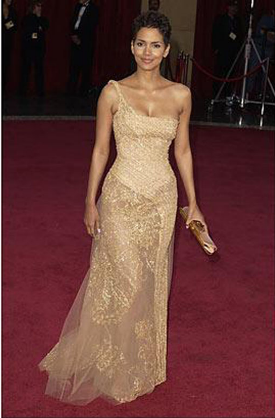
Halle Berry, 2003

Every time the girls sign up, it's a little bit of a challenge for them to keep their hair looking like it's still the same as when they first started. They have to keep it looking like it's still the same as when they first started.