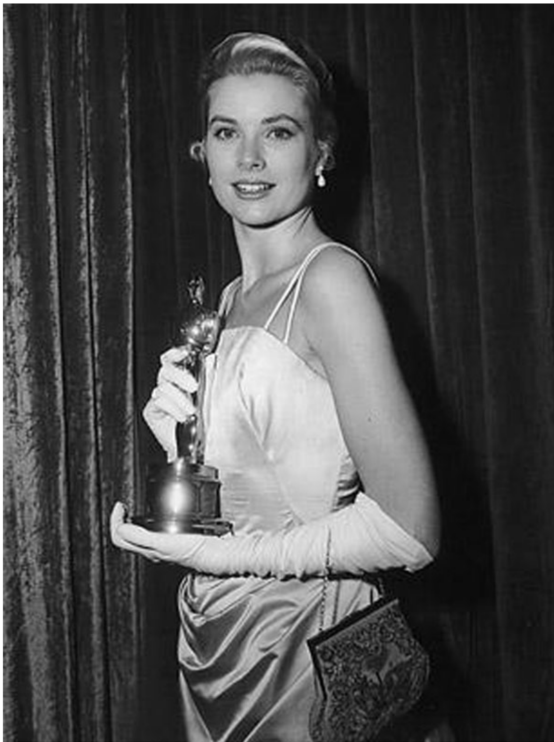
Grace Kelly, 1955

Share and like to view your favorite photos of celebrities of all time in Twitter, you are the